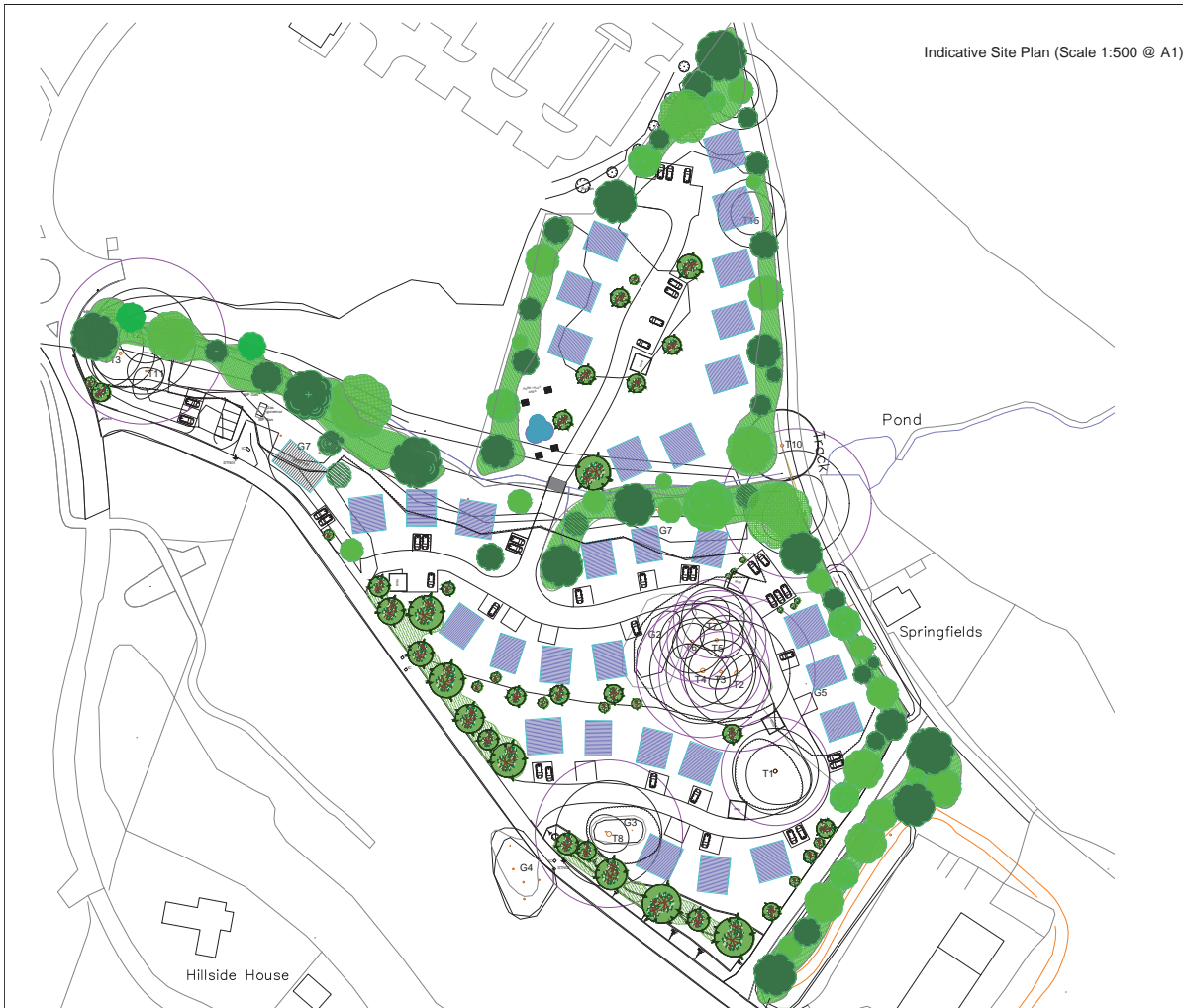
Indicative Site Plan (Scale 1:500 @ A1)

DRAWING NO: P01 B The Architect shall not be responsible for any dimensions obtained by scaling from this drawing. For dimensions to prevail the original must accompany the drawings. No liability shall be accepted by the Architect for any errors or omissions in the drawings. All dimensions shall be taken from the drawings. All dimensions shall be taken from the drawings. The drawing shall be made in accordance with the Building Regulations and all other relevant legislation. The Architect shall not be responsible for any errors or omissions in the drawings. All dimensions shall be taken from the drawings. All dimensions shall be taken from the drawings. The Architect shall not be responsible for any errors or omissions in the drawings. All dimensions shall be taken from the drawings. All dimensions shall be taken from the drawings.