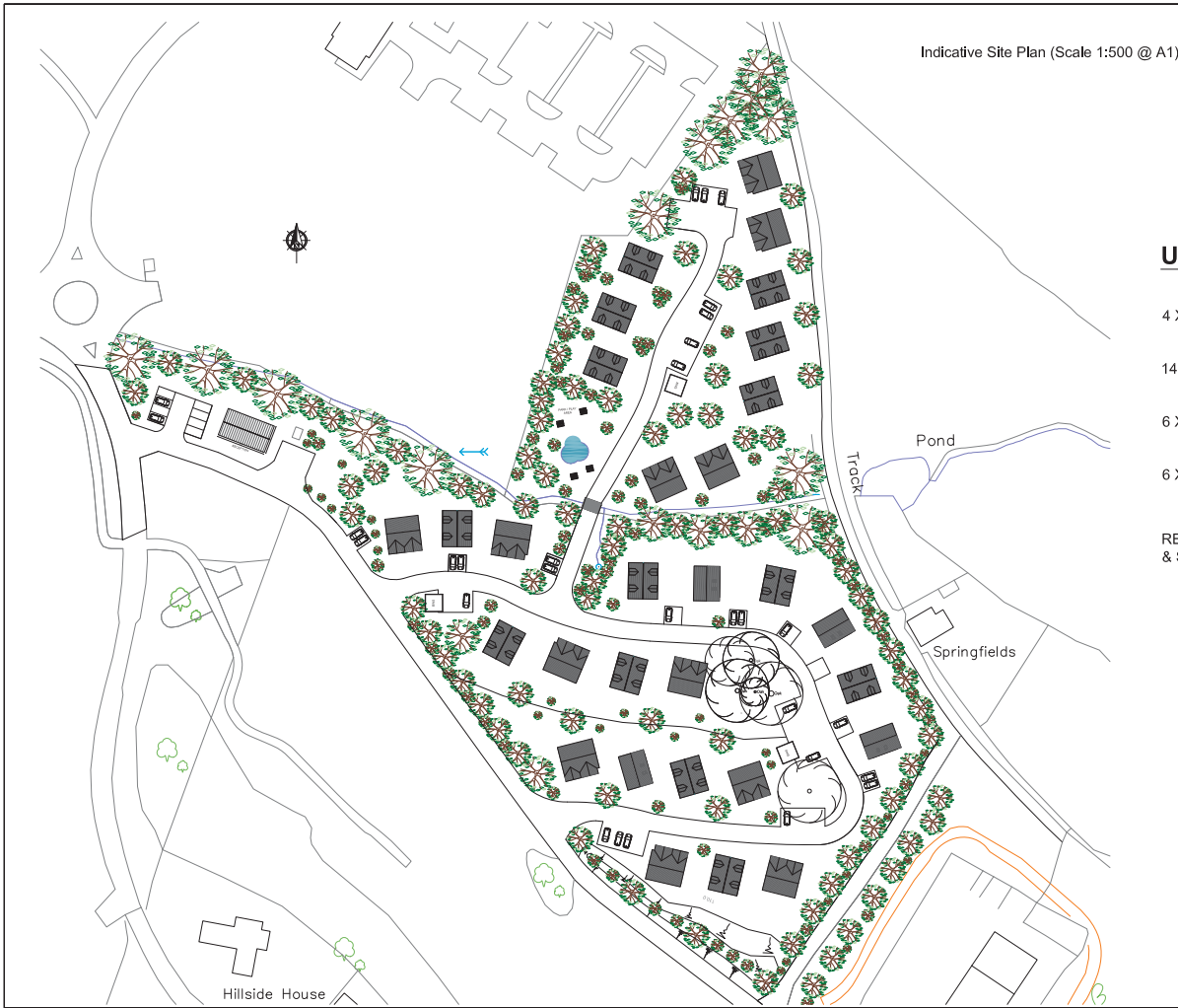
Indicative Site Plan (Scale 1:500 @ A1)

DRAWING NO: P01 The Architect shall not be responsible for any dimensions obtained by scaling from this drawing. For dimensions to prevail the original must accompany the drawings. No liability shall be accepted by the Architect for any errors or omissions in the drawings. All dimensions shall be taken from the drawings. All dimensions shall be taken from the drawings. All dimensions shall be taken from the drawings. The drawing shall be made in accordance with the Building Regulations and all other relevant legislation. The Architect shall not be responsible for any errors or omissions in the drawings. All dimensions shall be taken from the drawings. All dimensions shall be taken from the drawings. The Architect shall not be responsible for any errors or omissions in the drawings. All dimensions shall be taken from the drawings. All dimensions shall be taken from the drawings.