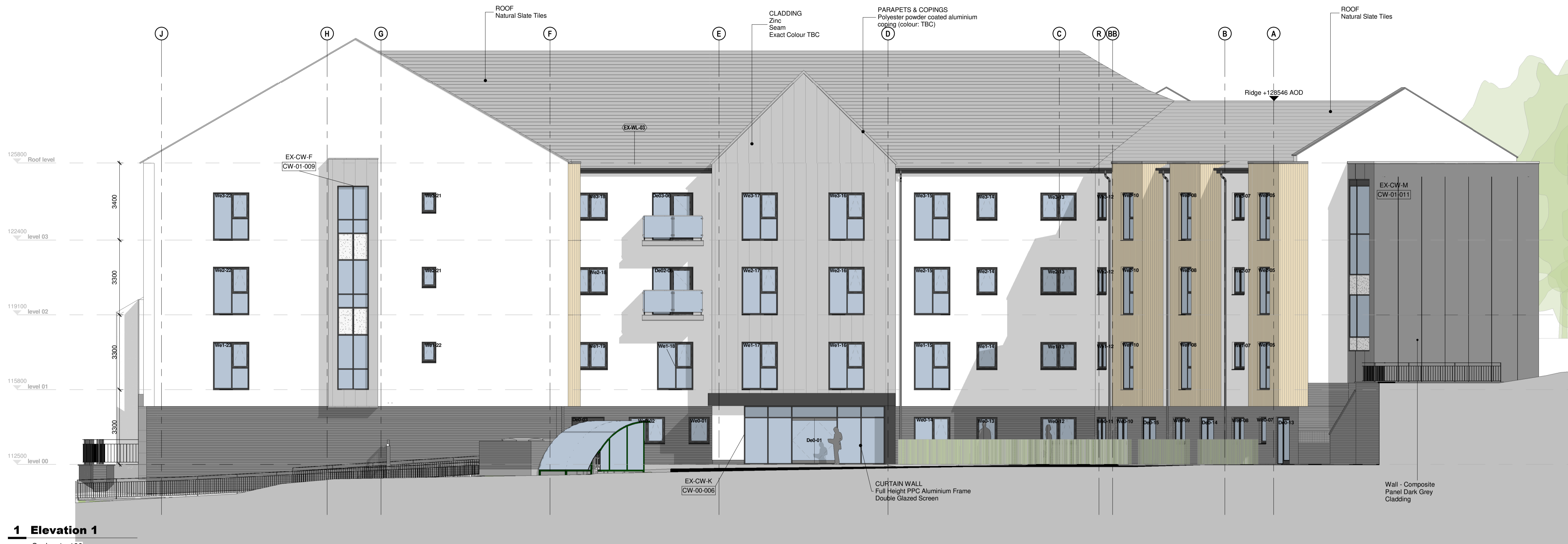
1 Elevation 1