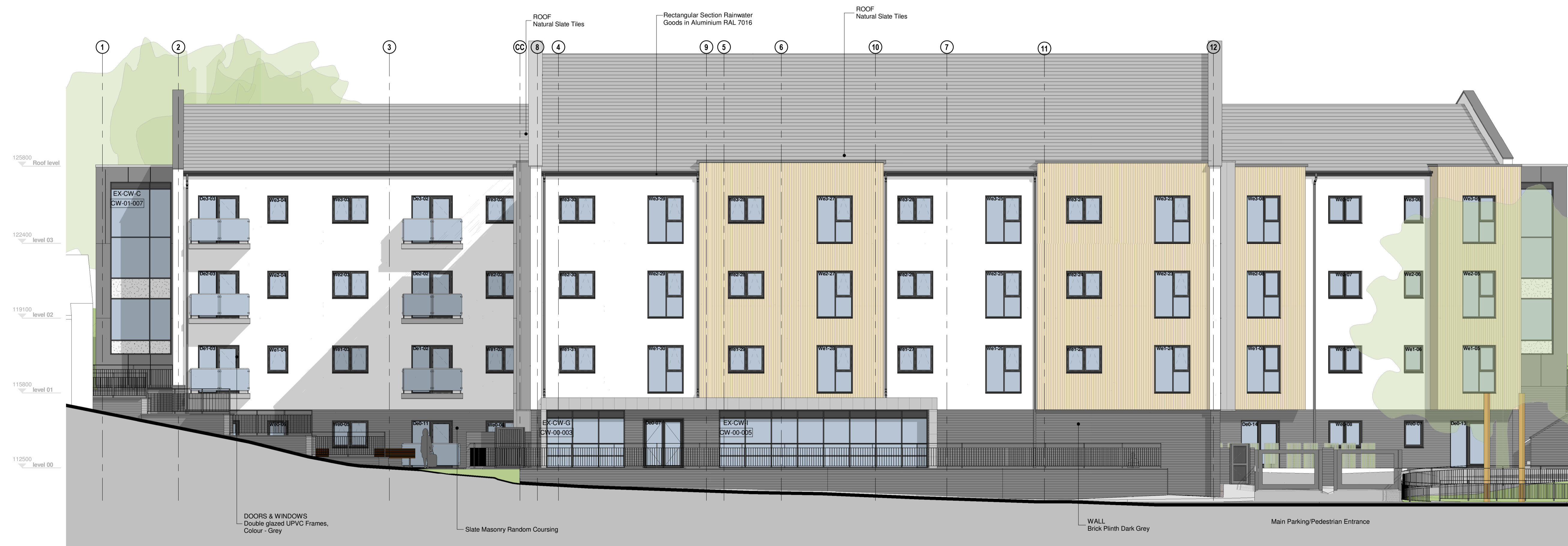
2 Elevation 2