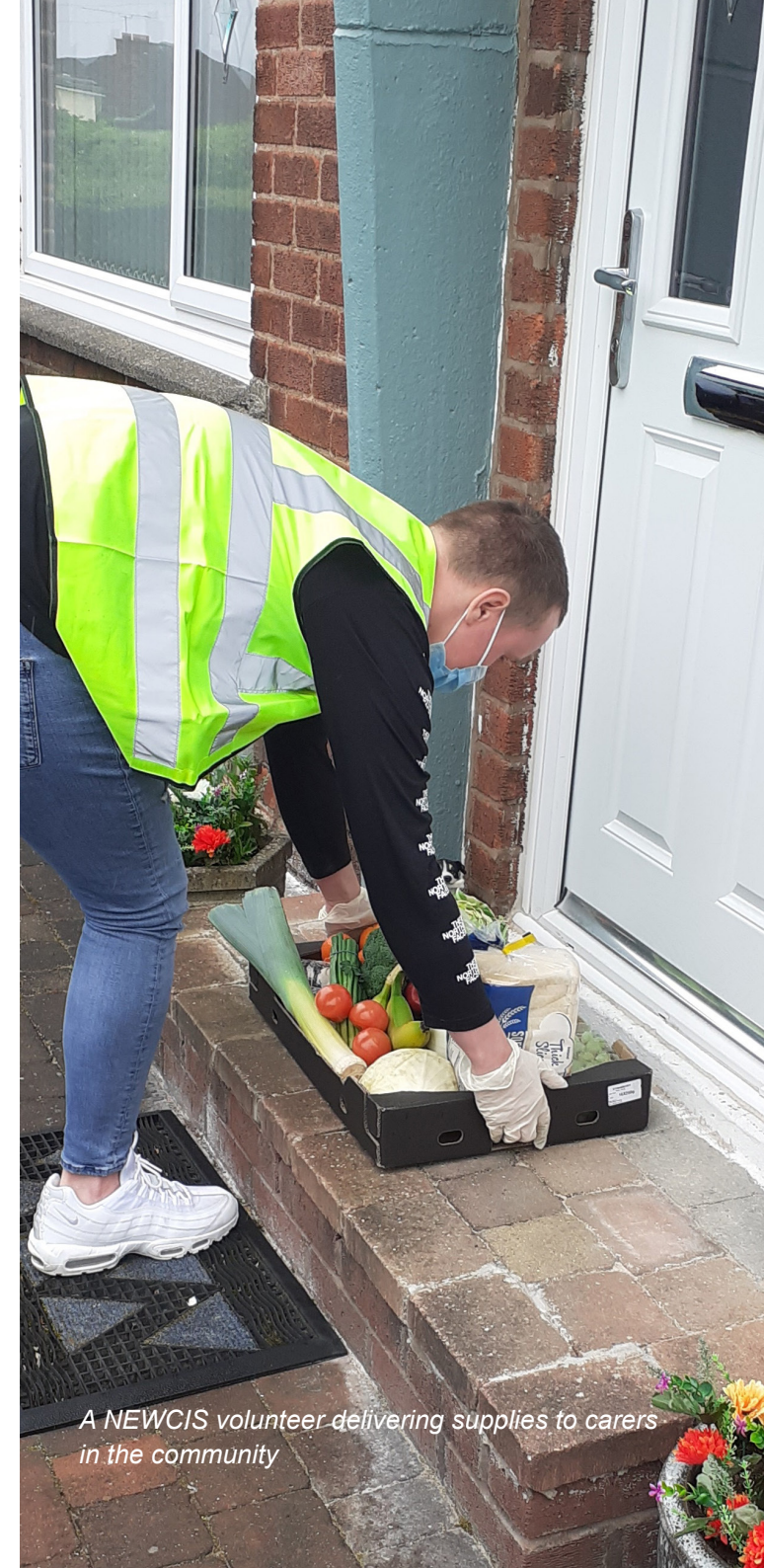
A NEWCIS volunteer delivering supplies to carers in the community

Relationships with the voluntary sector continue to be strengthened by our involvement with the Voluntary Sector Compact. This three-way partnership between the Council, Health Board and voluntary sector facilitates mutual understanding in respect of roles and responsibilities, and enables opportunities for partnership working to be fully utilised. Membership comprises the Chief Officer and Chair of Flintshire Local Voluntary Council, other voluntary sector members, the Chief Executive and Leader of the Council, and a senior manager from the Health Board.